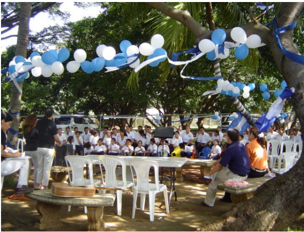
Students Celebrate Columbus Day in September

Staff participates in drama with an Indian tribe of long ago. This was hilarious!!